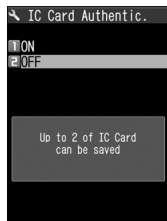
IC Card Authentication Window