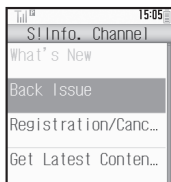
S! Information Channel Menu